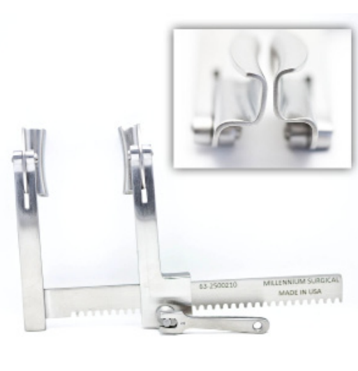
63-2500210 Infant Size | Swivel Blades (A) 12mm x (B) 40mm 90mm spread | 75mm arm length