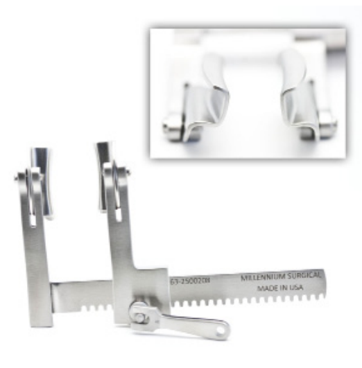
63-2500208 Neonatal Size | Swivel Blades (A) 10mm x (B) 30mm 85mm spread | 50mm arm length

This line of rib spreaders is used in thoracic surgeries. It consists of two broad, outwardly-curved blades, mounted on a ratcheted bar. Ribs can be spread by inserting the blades through a thorotomy incision and spreading them manually. Blades swivel for flexibility and ease of use.